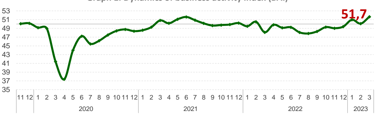
Graph 1. Dynamics of business activity index (BAI)*

Business activity improved in March, despite the supply problems. Enterprises of all sectors note an increase in the volume of new orders and inventories.