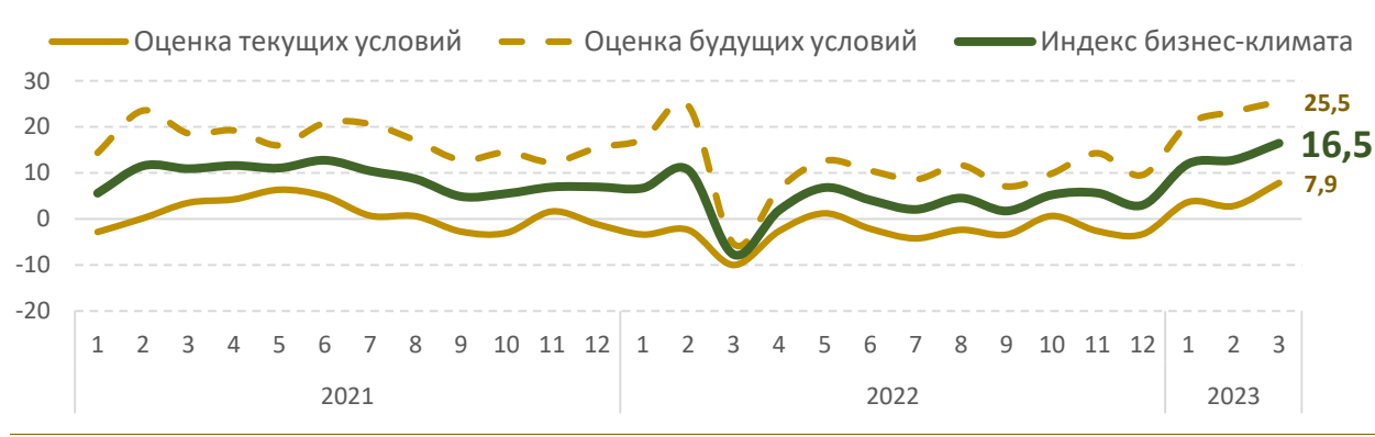
Graph 3. Dynamics of business climate index (BCI)*

The business climate index has increased noticeably. According to respondents, business conditions improved in March. Enterprises expect more favorable business conditions in the future.