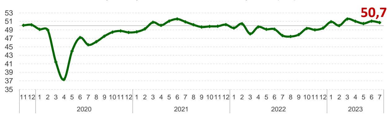
Graph 1. Dynamics of business activity index (BAI)*

In July, business activity slowed down slightly, but the indicator remained in the positive area, amounting to 50.7.