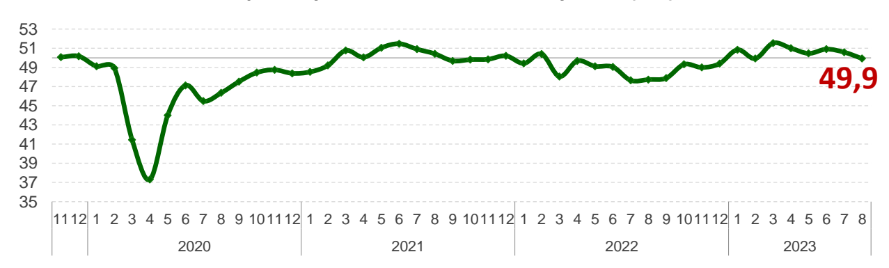
Graph 1. Dynamics of business activity index (BAI)*

In August business activity decreased slightly, the index is on the border of the neutral line (mark 50), indicating an unchanged situation.