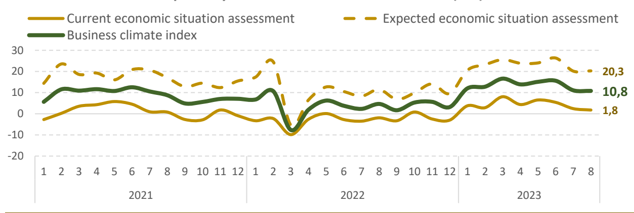
Graph 3. Dynamics of business climate index (BCI)*

The business climate index decreased slightly, but the index remained positive. Assessments of current business conditions decreased, while assessments of future business conditions improved slightly.