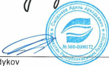
Adil Syzdykov Auditor

Auditor Qualification Certificate No. МФ - 0000172 dated 23 December 2013