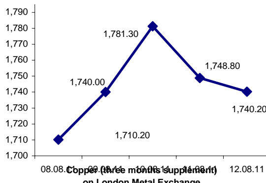
Copper (three months' settlement) on London Metal Exchange